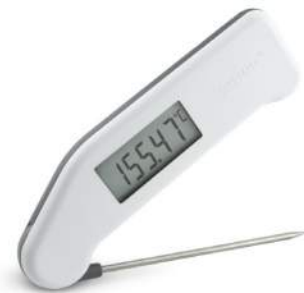
Reference thermometer with 0.04 °C accuracy and NIST calibration traceable certificate Display Resolution: 0.01 °F