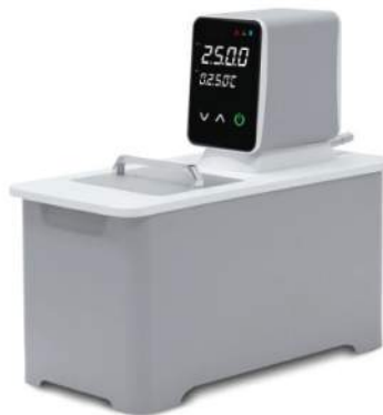
6-liter circulating waterbath with 0.01 °C stability, Digital interface, Stainless steel tank Dimensions: 17.5" x 8" x 16"